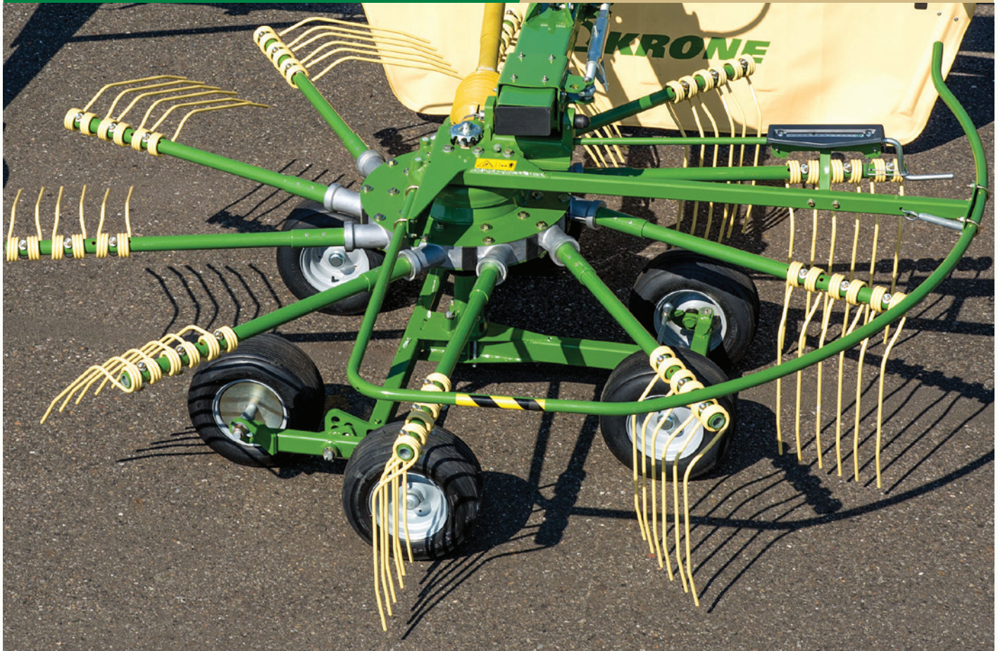
SWADRO TC640 RAKE