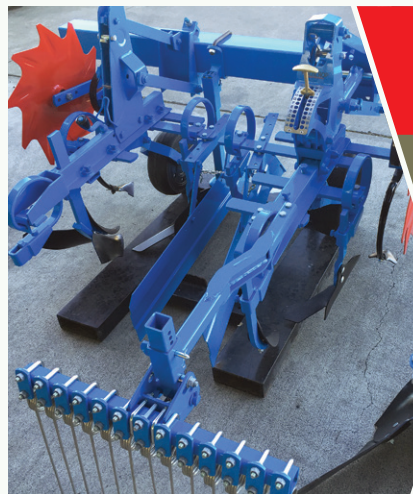
Monosem SCD and Multicrop cultivator.