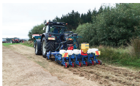
Monosem/Oekosem combo at Waimumu.