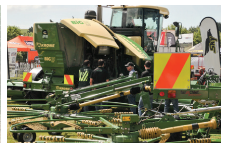
Our display at Southern Field Days.

We represent another nine reputable brands from USA, Canada, France, Germany, Austria, Denmark and Switzerland and we could not hope to have all of them present in rubber and steel on our site.