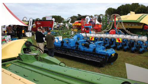
Our display at Central Districts Field Days.