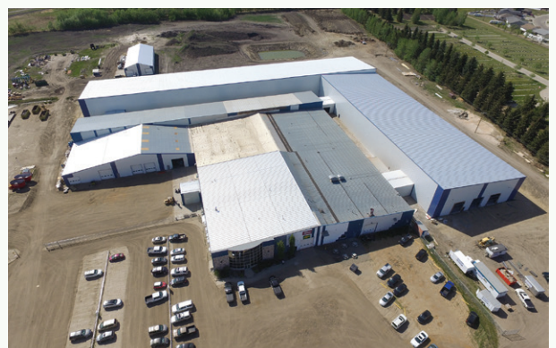
Supreme International factory showing the extension.

Supreme International has expanded its manufacturing facility in Alberta, Canada by 9300m 2 to cope with increased demand and additional product lines. This addition offers a total of just over 23,000m 2 , allowing production to double – they now have two 20-tonne overhead cranes each with 32.6m spans. The welding line has doubled in size and the assembly line tripled. A new paint prep shop and a new powder coating booth have been installed. To ensure worker safety, new LED lighting has been installed. New products coming off the line are the Delivery Box (28.8m 3 and 34.5m 3 ), tractor drawn 1700TR (44.9m 3 ) – triple screw and the self-propelled, self-feeding SPSL30T (31.4m 3 ). ➡