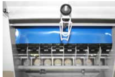
8 splines distribution

Outlet positioned as close as possible to the soil in front of the machine for a uniform distribution on all width and stimulate germination of seeds.