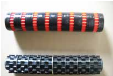
2 metering units for small or big seeds

200 or 400L Tank with splines distribution, driven by mechanical rate governor wheel, allow dosing between 2 to 100 Kg/Ha Distribution fan driven by 2 electric motors