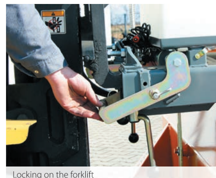
Locking on the forklift