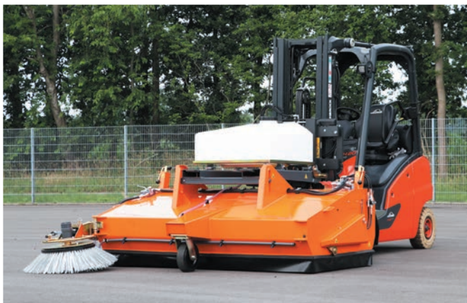
bema 40 Industry with rotary side brush and water spray unit