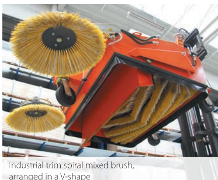
Industrial trim spiral mixed brush, arranged in a V-shape