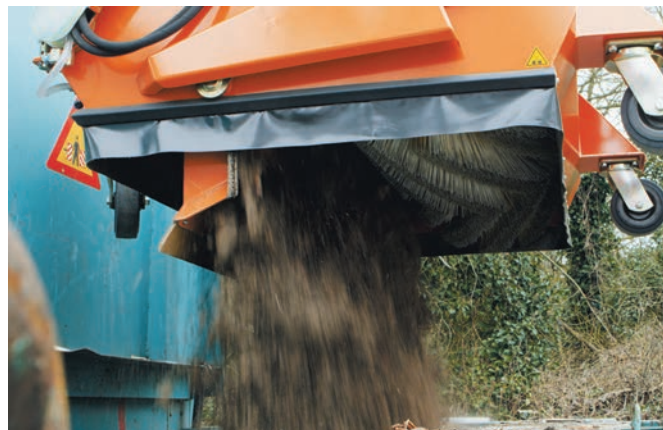
Convenient emptying above container