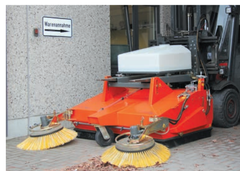
bema 40 Industry in use outside