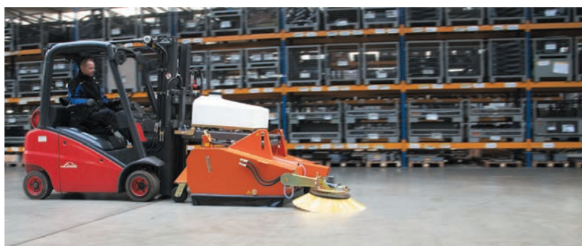
bema 40 Industry in use inside